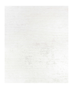
TR1267 Three White