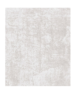
TR1265 Three Beige