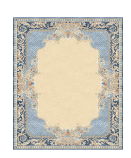
TR1539 Aubusson Tapisserie Floral Blue