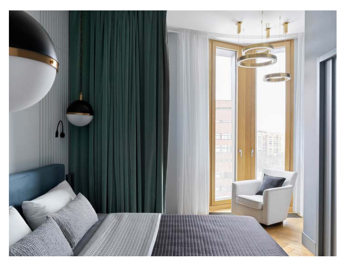
The bed is made according to the designer's sketches. Pendant lighting fixtures, Visual Comfort. In the lounge area by the bedroom: armchair, Restoration Hardware; lamp, Henge.