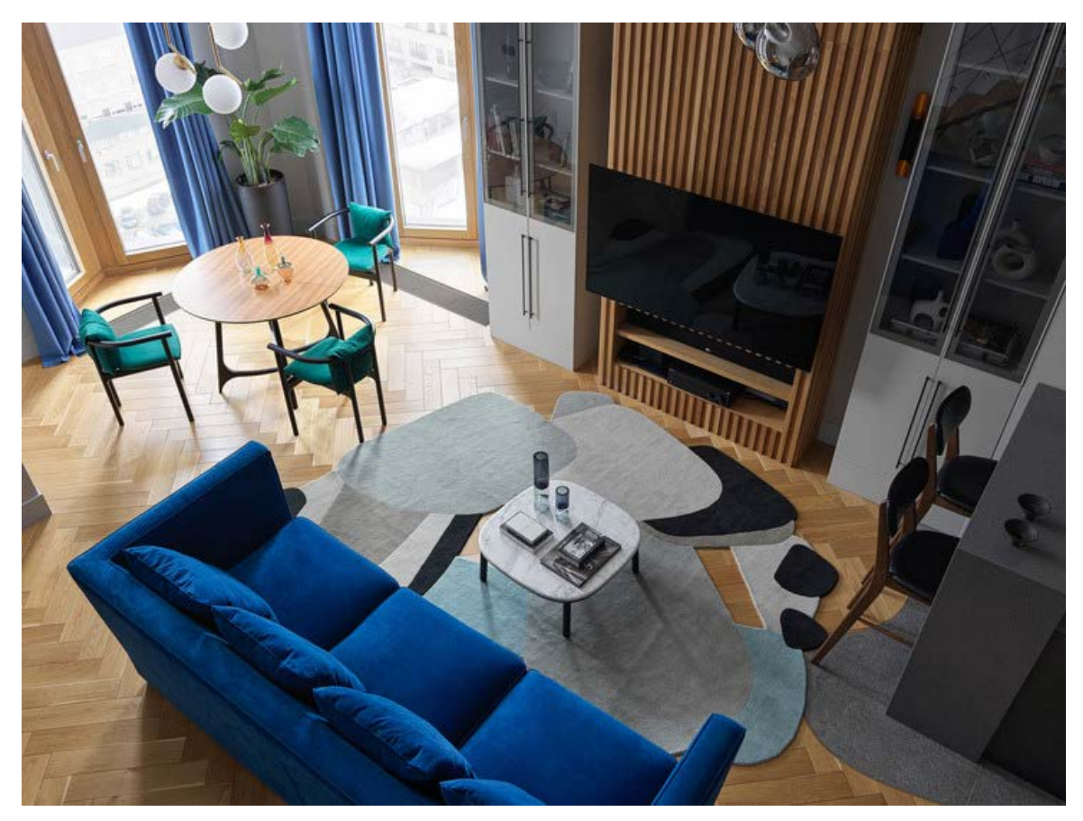
View from the mezzanine floor to the living room. In the center of the composition are built-in racks for the client's music equipment, who considers sound quality to be the most important component of the design project.

STYLE: EKATERINA NAUMOVA