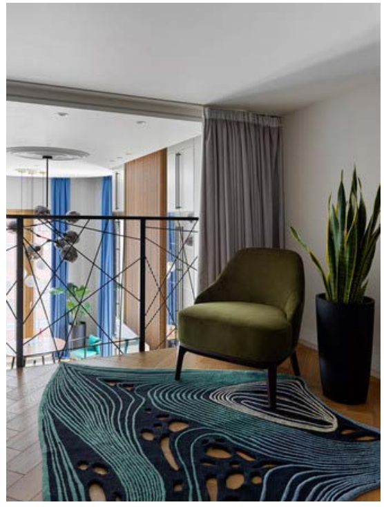
Armchair, Chaircollection. Carpet, Tapis Rouge.