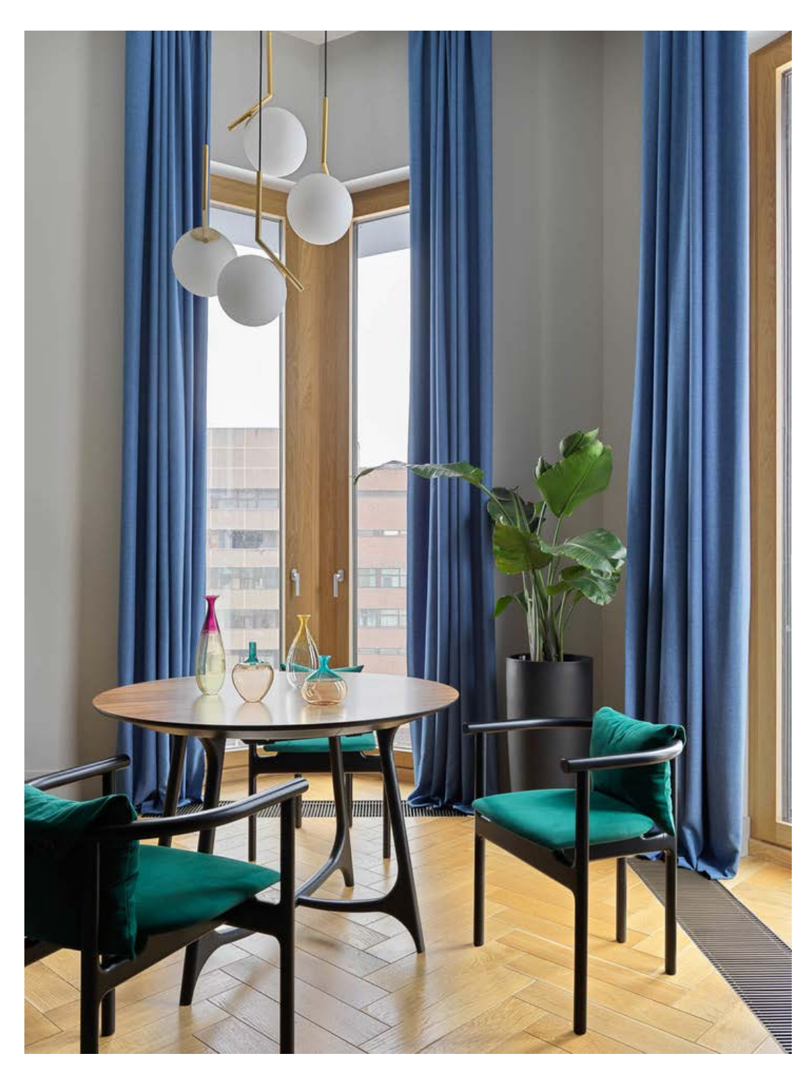
The complicated geometry of the bay window with sharp corners, where the dining room is located, was softened and balanced by the curtains. Table and chairs, Unika Moblar. Pendant lamp, Flos. Vases, Moon Stores. The plant, Green Line.