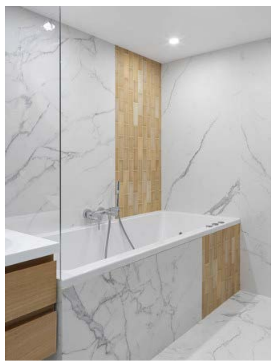
Bathroom. Sanitary ware, Villeroy & Boch