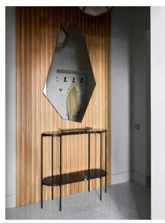
Entrance Hall. Console, Create M. Studio. The wall panel and mirror were made according to the sketches of the designer.