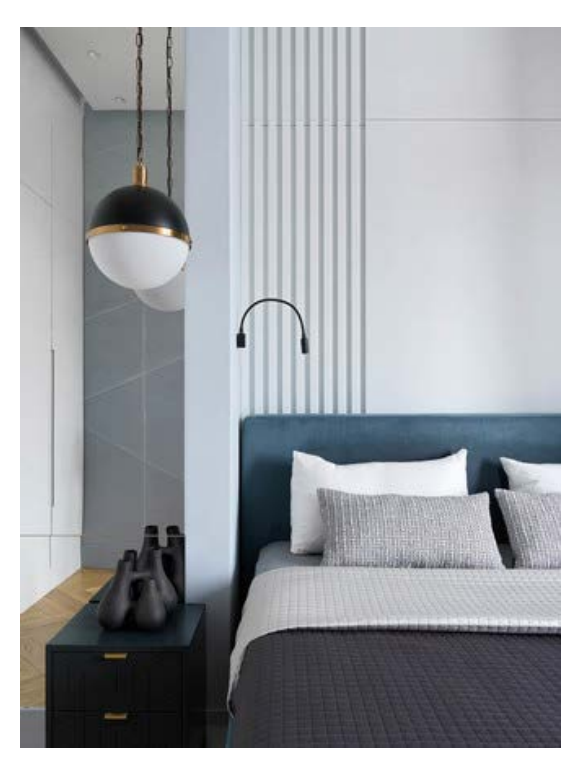
Bedside cabinet, Idea. Bed, wall panels and closet Work area. Built-in furniture made to order accordare made according to the sketches of the designer.