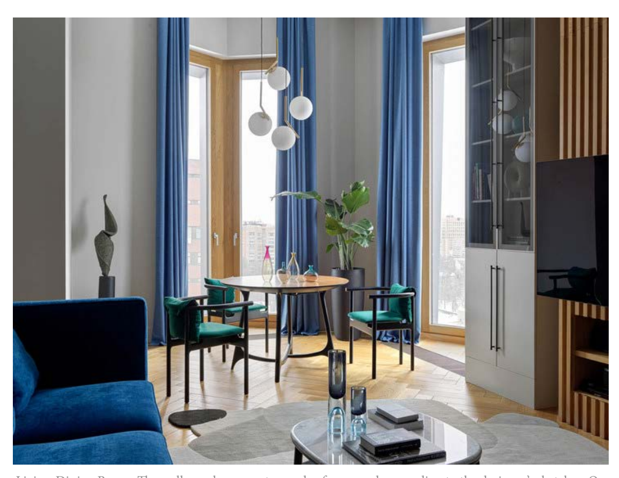
Living-Dining Room. The wall panels, carpentry, and sofa are made according to the designer's sketches. On the left side of the window is the sculpture of Igor Khristolyubov.