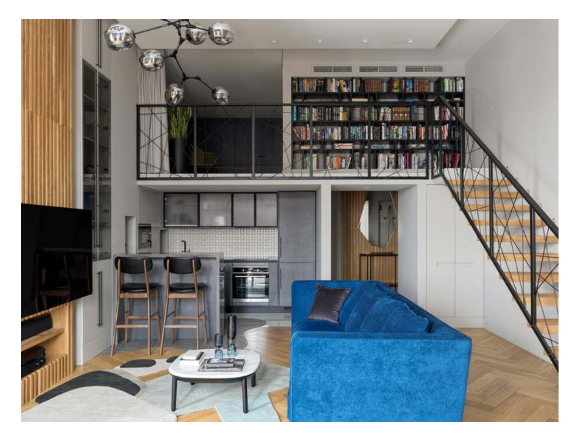
The wall panels, carpentry and sofa are made according to the designer's sketches. The coffee table, Chaircollection.

"The apartment is located on the top floor of one of the towers of a modern residential complex," says designer Ksenia Mezentseva. "Due to this location and the unique ceiling height of 4.2 meters for Moscow, we were able to increase the living space by adding a mezzanine floor, which housed a recreation room with a library and a guest sleeping place."