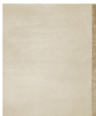
TRL1614 Breton Gold