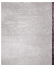
TRL1613 Breton Lavanda