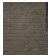
TRL1616 Breton Black