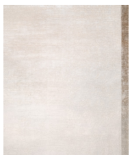
TRL1611 Breton Beige