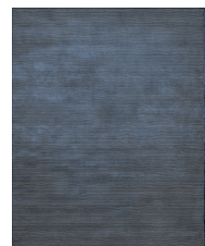
TRL1617 Breton Deep Blue