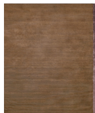
TRL1615 Breton Purple