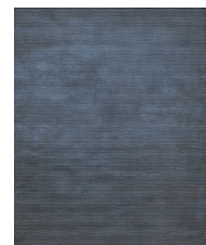
TRL1617 Breton Deep Blue