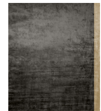
TRL1595 Color Block Black