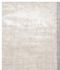
TRL1591 Color Block Silver