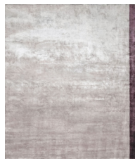
TRL1592 Color Block Lavanda