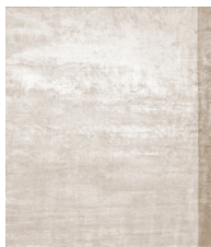
TRL1590 Color Block Beige