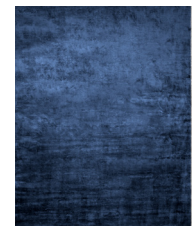
TRL1596 Color Block Deep Blue