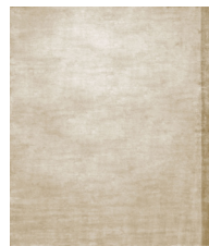
TRL1593 Color Block Gold