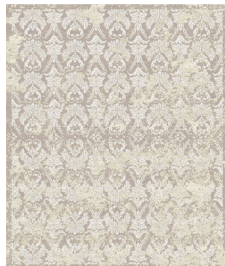
TR2114 Damask Vintage Gold