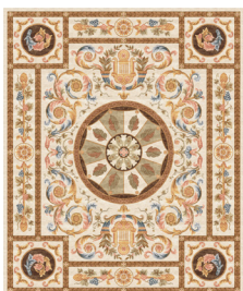
TR1664 Royal Arfa Ochre