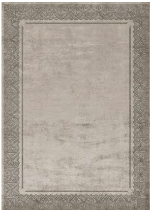
TR1014 Savoy Smoky Grey