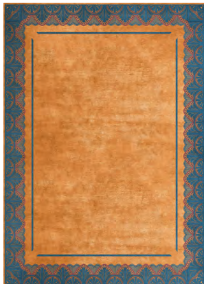
TR1012 Savoy Noble Orange