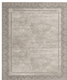
TR1014 Savoy Smoky Grey