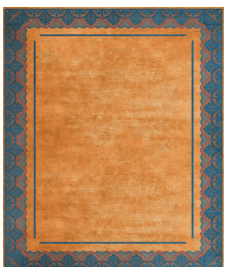
TR1012 Savoy Noble Orange