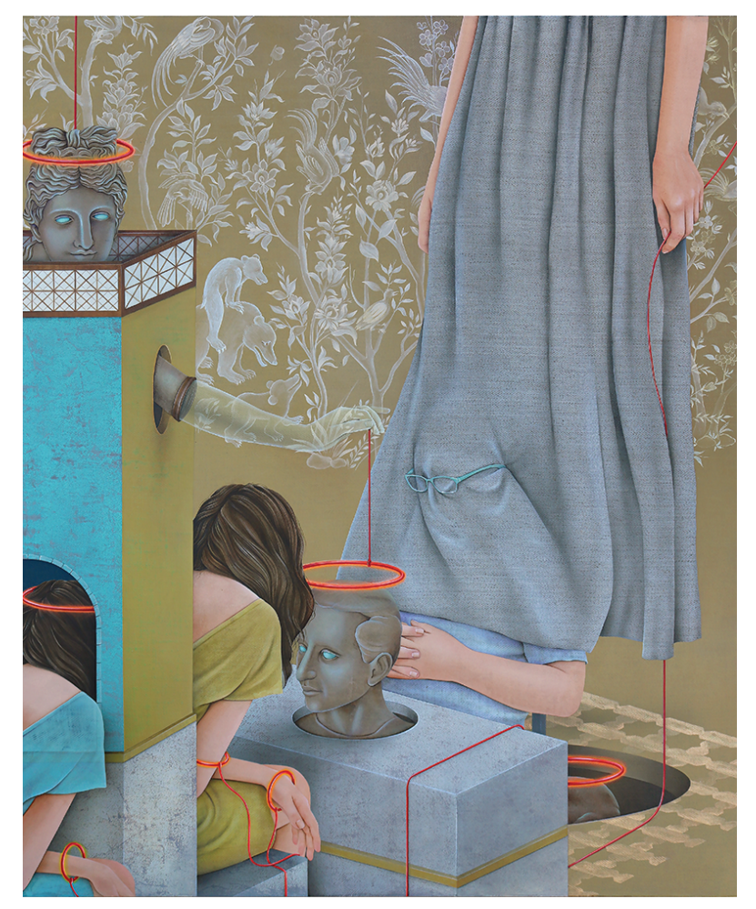
Ascension by Arghavan Khosravi as seen in "New Surrealism: The Uncanny in Contemporary Painting".