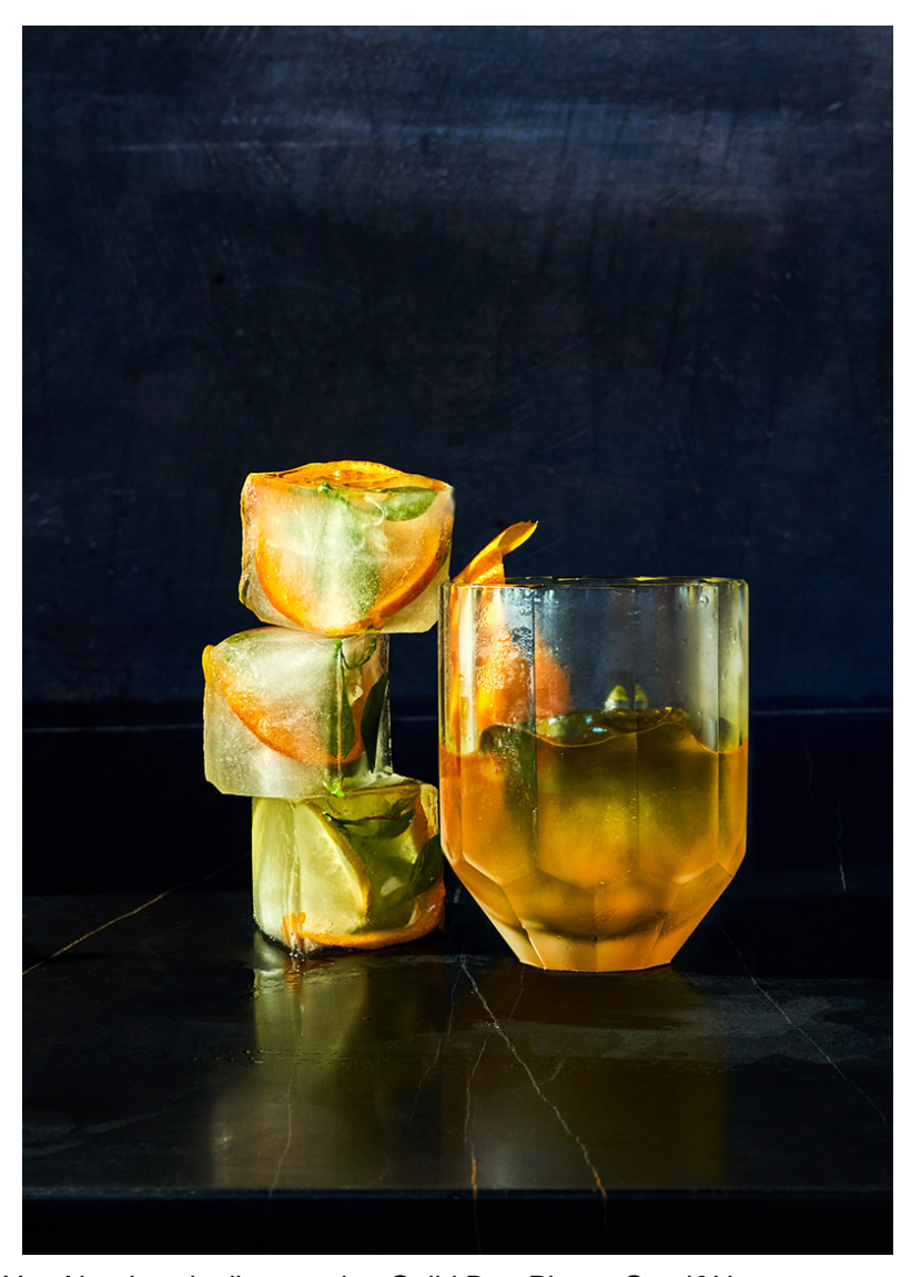
The Fool You Need cocktail, served at Guild Bar. 6. Roman & Williams Unveils Guild Bar in New York City

TYPE: Web Grand Public > Versione online