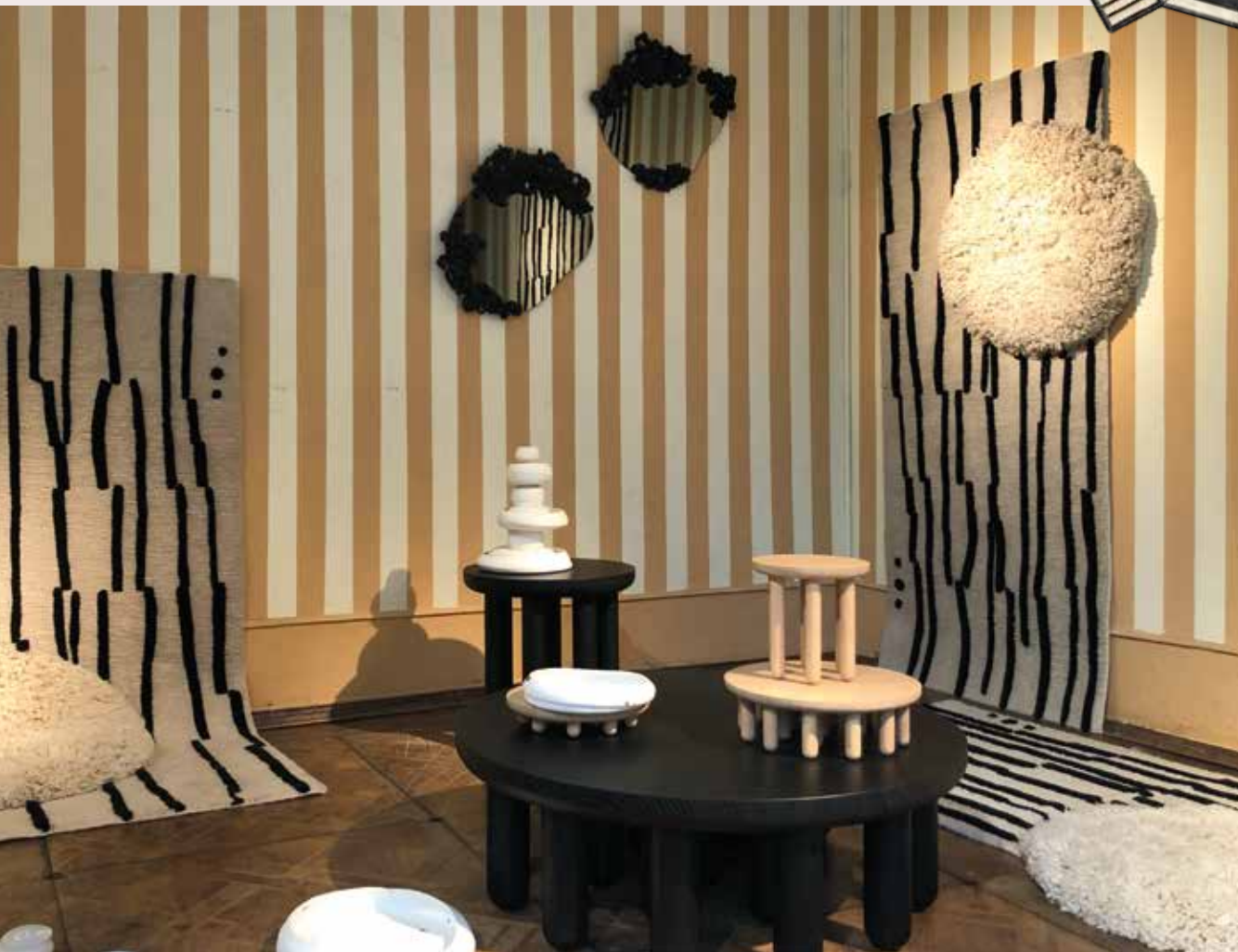
01 Castello rug , Monumenti Collection, Tapis Rouge