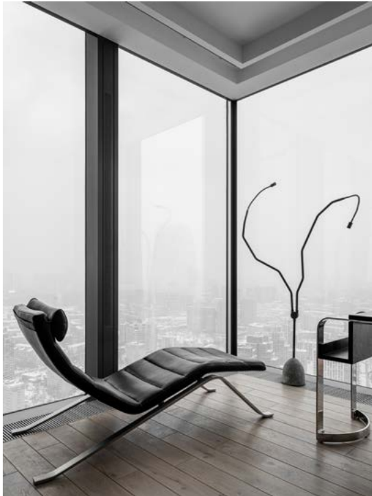
Office. Chaise lounge, BoConcept. Tree Light floor lamp, design by Rhoda Arada, 1984, Alina Pinsky Gallery.

STYLE: YULIA CHEBOTAR