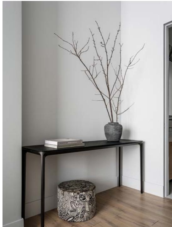
Porcelain stoneware, REX Ceramiche.

PHOTO BY MIKHAIL LOSKUTOV. STYLE: YULIA CHEBOTAR