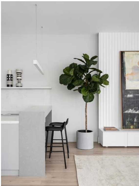
The living room area seamlessly transitions into the kitchen area.

STYLE: YULIA CHEBOTAR