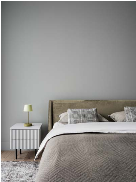
The cabinet is made according to the sketches of Woodcraftone designers. The mirror is made to individual dimensions, “Mosstekloproekt”.

“For us, creating an interior is about revealing a person’s individuality through their space. We live each interior with the customer,” the designers admit. - For this reason we work in completely different styles, and our interiors are not like one another. This time they succeeded in creating a clean and light space that encourages reflection and creative exploration.