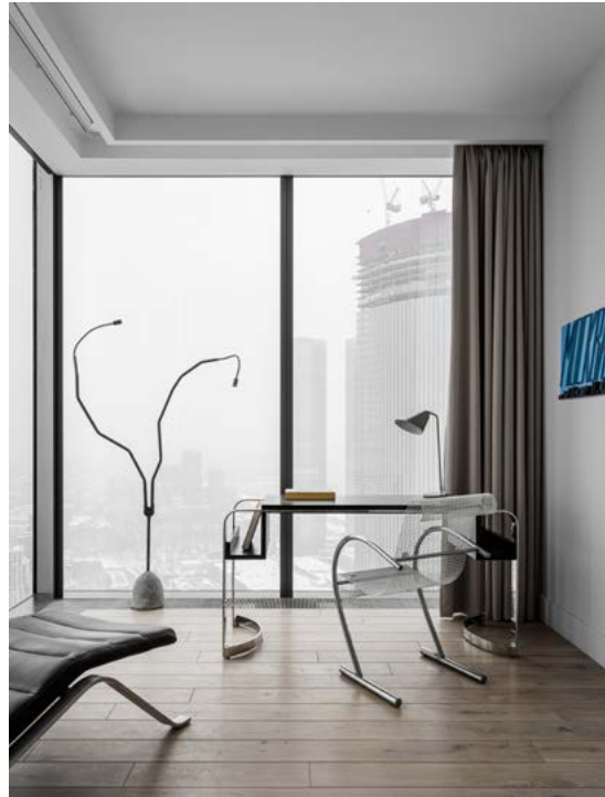
Fragment of an office.

STYLE: YULIA CHEBOTAR