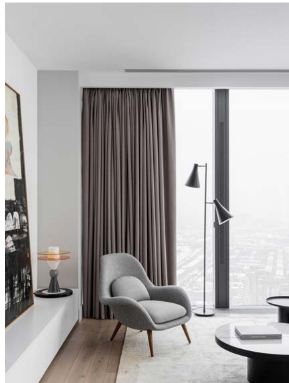
A fragment of the living room.

STYLE: YULIA CHEBOTAR