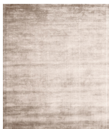
TRL2281_2B Beige 2