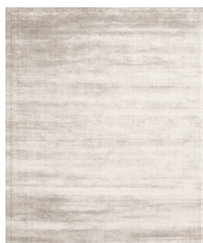
TRL2281_3B Beige 3