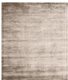
TRL2281_1B Beige 1