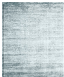
TRL2286_4B Blue 4