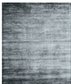
TRL2286_2B Blue 2