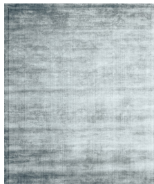
TRL2286_3B Blue 3