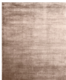
TRL2282_4B Brown 4