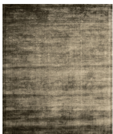
TRL2287_2B Green 2