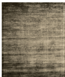
TRL2287_2B Green 2