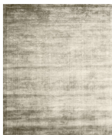
TRL2287_4B Green 4