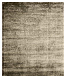
TRL2287_3B Green 3