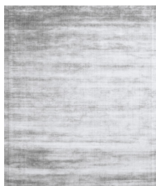
TRL2280_3B Grey 3