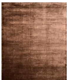
TRL2284_2B Orange 2