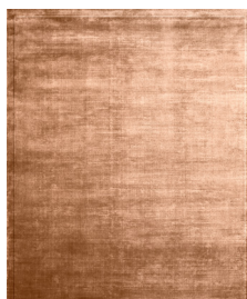
TRL2284_4B Orange 4