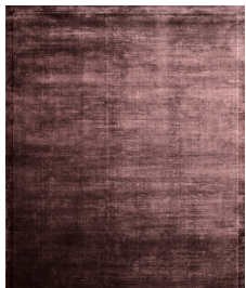
TRL2284_1B Orange 1