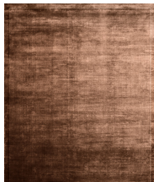
TRL2284_2B Orange 2