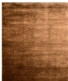
TRL2284_3B Orange 3