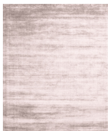
TRL2285_4B Rose 4