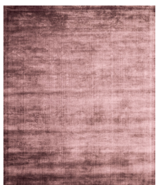
TRL2285_1B Rose 1