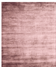
TRL2285_2B Rose 2